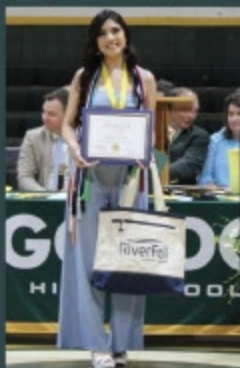
Gordo High School University of South Alabama