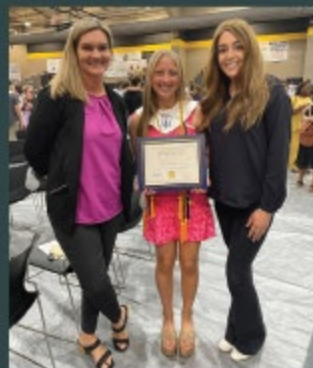
Sipsey Valley High School Shelton State