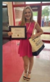
West Blocton High School The University of Alabama